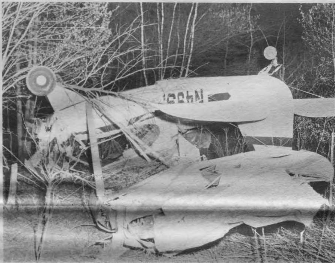
REMAINS: Crashed plane a PA-11 Piper Cub, twisted and broken in a wooded area of Madison Township near the Cedar Grove School on Route 516. Crash took the life of Austin Burnes of Hazlet

How Thomson in his dazed and bleeding condition managed to trek almost a mile from the crash scene is also a mystery. The accident was the second aircraft fatality reported in the past ten years in Madison Township. In 1954 a single engine Army Aircraft stationed at Fort Monmouth crashed approximately a half mile from the Sunday crash. The previous air crash took the lives of four army personnel, when the plane dove into an apple tree on the Rose Farm. In that crash the bodies were completely torn apart by the impact and little if anything resembled a airplane. A crater at least four foot deep was torn in the ground and the tree completely demolished by the crash.